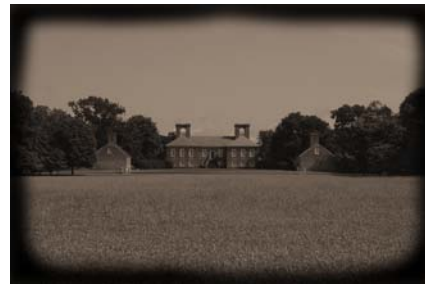
Photo 2: A modern photograph of Stratford Hall plantation transformed into a daguerreotype using Corel's Time Machine function.